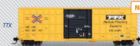
Trinity 50' Hy-Cube Box Car