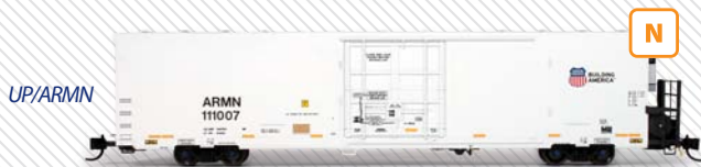
Trinity TRINCool 64' Reefer