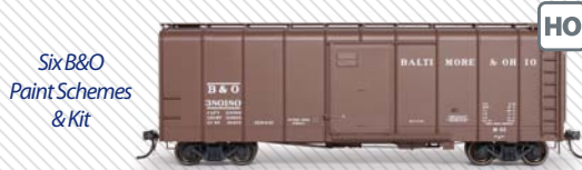
B&O M-53 Wagontop Box Car