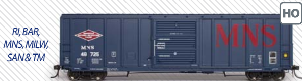
P-S 5344 Box Car