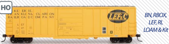
Evans-USRE 5277 Box Car (Early)