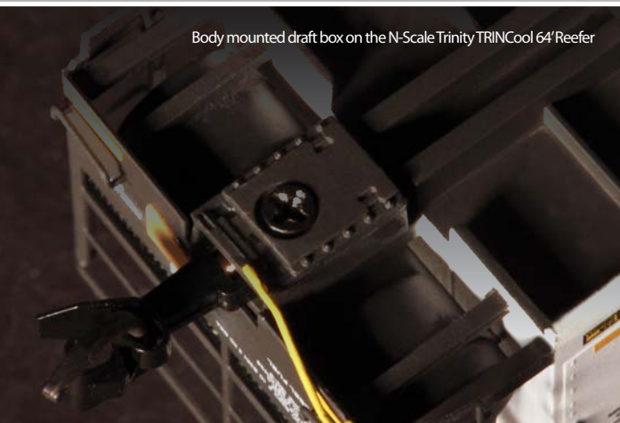
Body mounted draft box on the N-Scale Trinity TRINCool 64' Reefer

Sign-up at www.ExactRail.com/insider to start receiving our email newsletter sent out with each new product announcement.