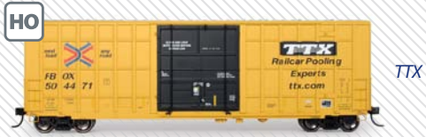
Trinity 50' Hy-Cube Box Car