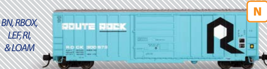
Evans-USRE 5277 Box Car (Early)