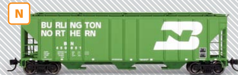
PS-2CD 4427 Covered Hopper