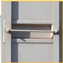
Correct grab or ladder style per the prototype