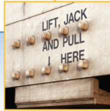
Finely-cast huck bolts