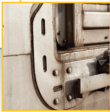
Precision-molded door details