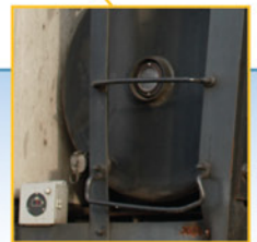
Fuel gauges and meters