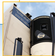
Authentic refrigerator unit